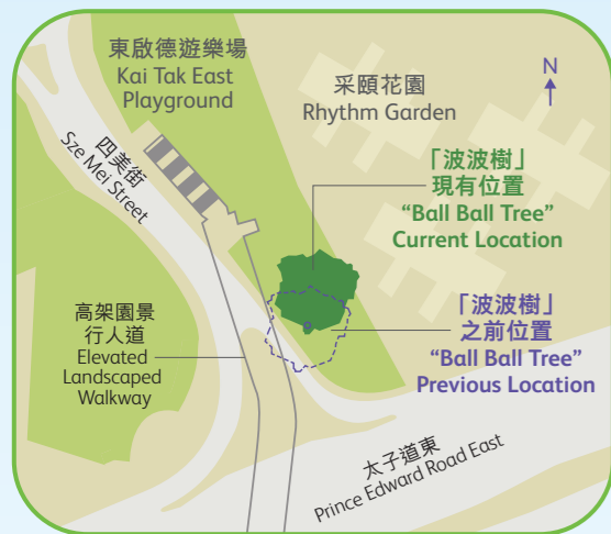
「波波樹」搬家影片 Video clip on the transplant of “Ball Ball Tree”

因樹冠呈圓形而被街坊稱為「波波樹」的巨大細葉榕已順利搬家，繼續茁壯成長。為提供足夠空間進行LW4高架園景行人道和一條新連接路的建造工程，這棵高約10米和擁有約18米樹冠的年長細葉榕，需要連泥膽遷移約10米，以給予樹木一個更理想的生長環境及保持其形態。經過10個月時間的籌備，工程團隊於2018年7月成功將「波波樹」遷移至預定位置。其後，「波波樹」更挺過同年超強颱風「山竹」的吹襲，現於東啟德公園茁壯成長。公園位於新蒲崗四美街，已於去年8月開放予公眾使用。